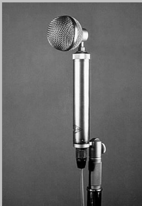
Right: Omni with basket