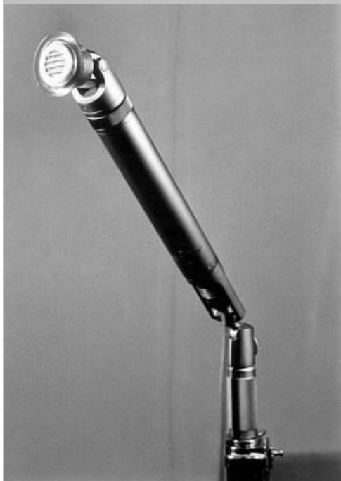
Left: Switchable omni/cardioid with swivel

The CM 61 was specially designed for the ELA. Changeable omni, cardioid and switchable omni/cardioid capsules with and without swivel were available. The preamp worked with an EF94 (6AU6) valve plus an output transformer